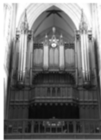
The Cavailleé-Coll organ in the Basilica Church of Ste-Clotilde

In the 19 th century, when Anglican worship was built around set-pieces of 4-part choral music, catholic liturgy in France remained focused on the melodies of plainsong upon which the organist would improvise to link and enrich the various sections of the service. The art of the improviser was greatly encouraged and enhanced by the wonderful developments in organ building achieved by the likes of Cavailleé-Coll; so much so that the extended and gloriously colourful improvisations at the conclusion of mass began to be an attraction in themselves!