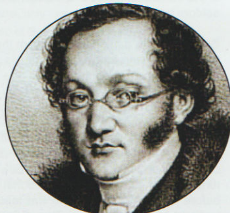
Ignaz Franz Castelli