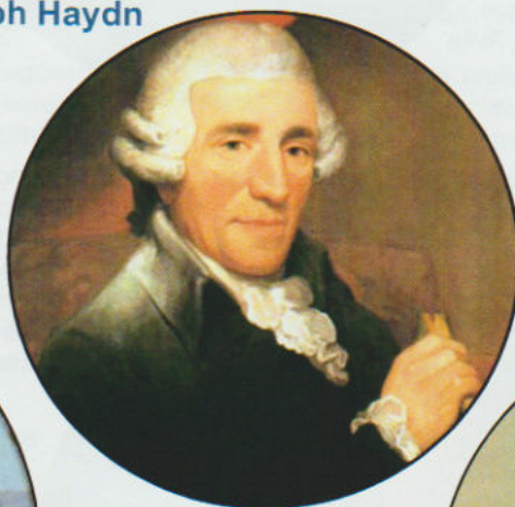
Franz Joseph Haydn

op95 string quartets are among the remarkable and rich legacy of works composed by Beethoven whilst residing at the Pasqualatihaus. In 1811 Pasqualati's wife Eleanore died aged just 24. Beethoven composed the Elegischer Gesang, a setting of a text by Ignaz Franz Castelli, in 1814 for the 3 rd anniversary of Eleanore's death. Little known, this deeply serene and poignant work for voices and strings is punctuated with heartfelt – and characteristic – musical cris de coeur .